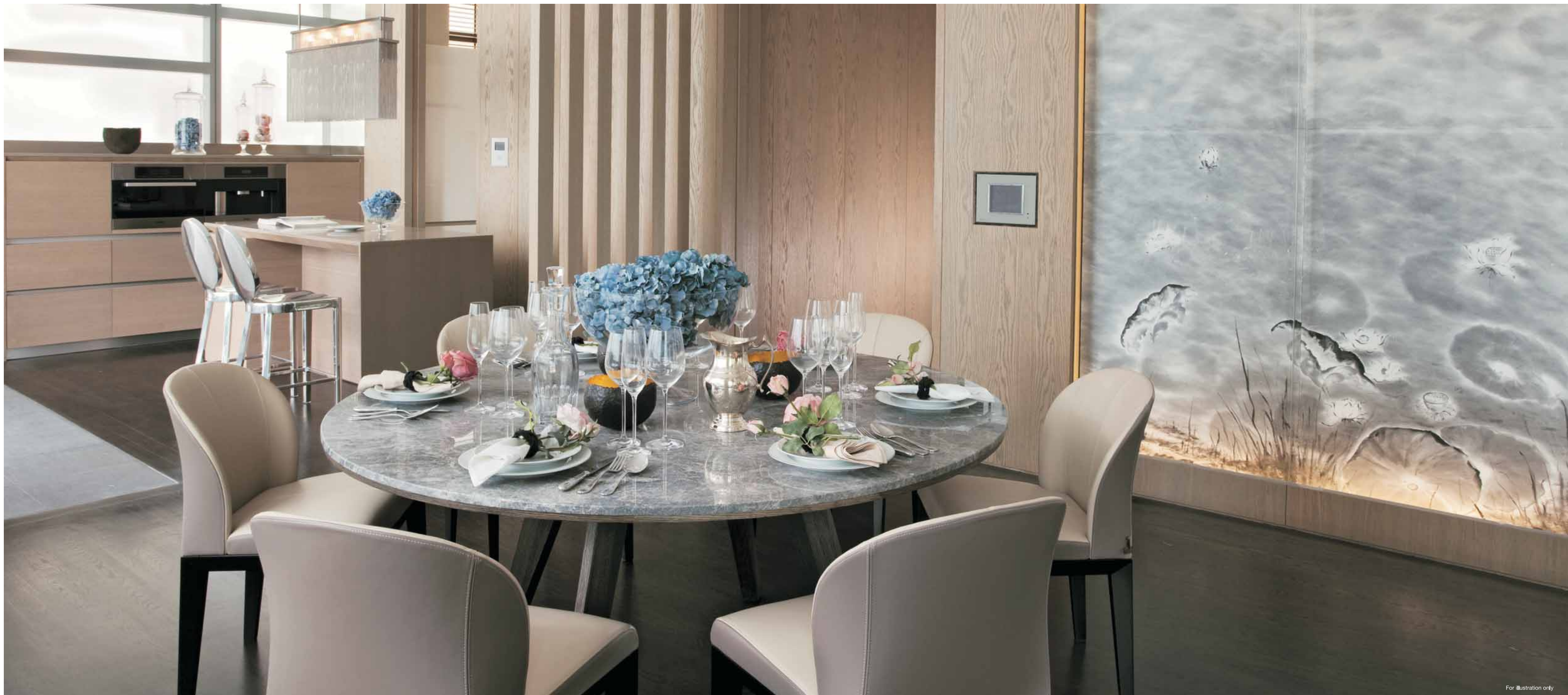
Dining Room – A vast space to entertain, wine and dine in style