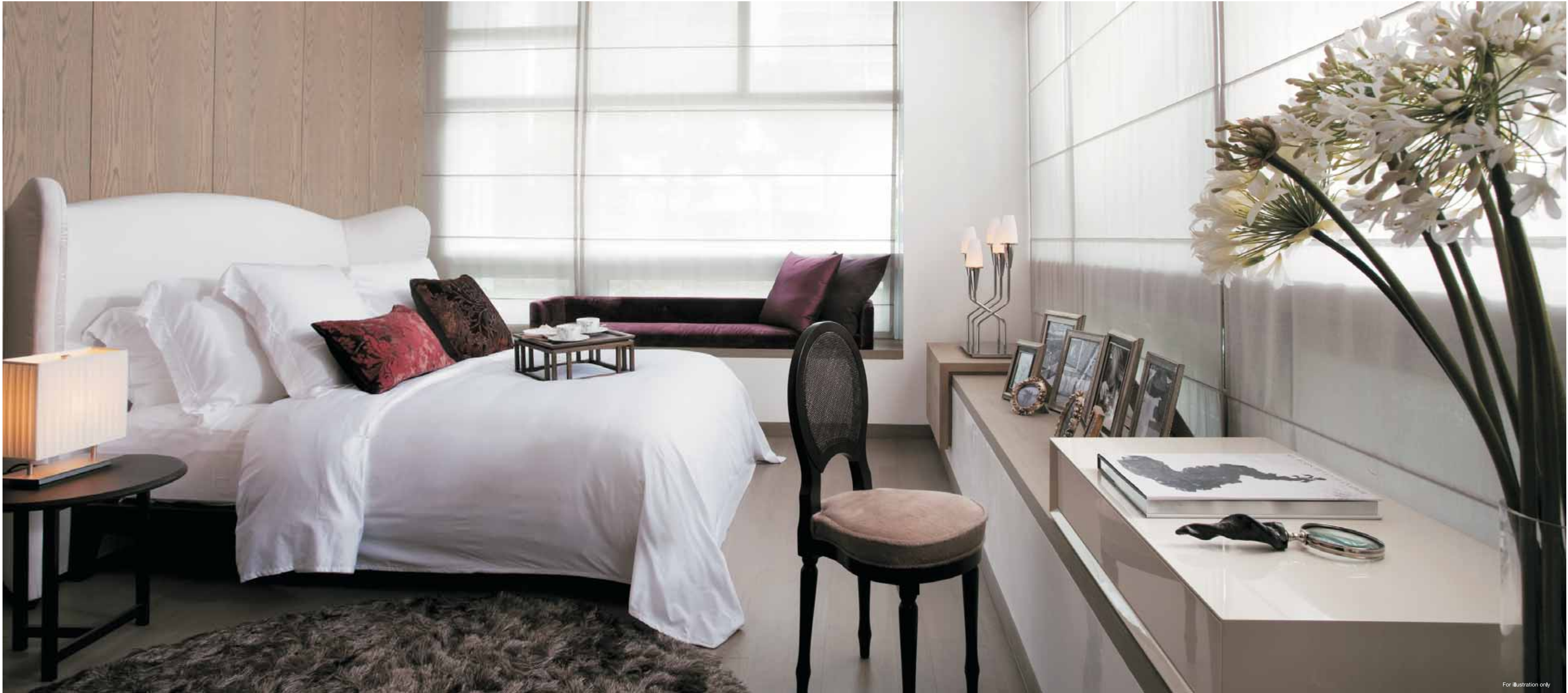
Master Bedroom— Enjoy total privacy and exclusivity in this large personal living space