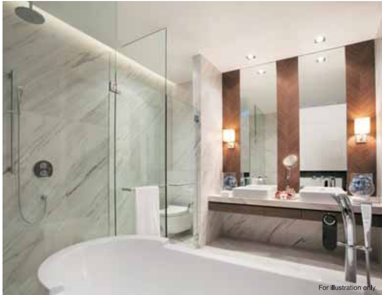
Master Bathroom – Soak in the attention to detail, right down to the superior fittings from Grohe and Duravit