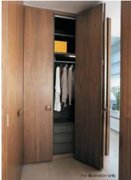
Walk-in Wardrobe* – With luxuriant space for your designer collection, it is like stepping into your private fashion gallery.