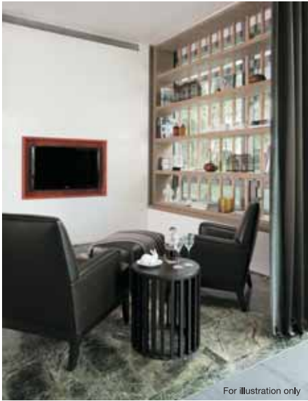
Family/Study Room – Enjoy the freedom to transform this into a conducive area for a study, a library or even an entertainment room with your very own theater