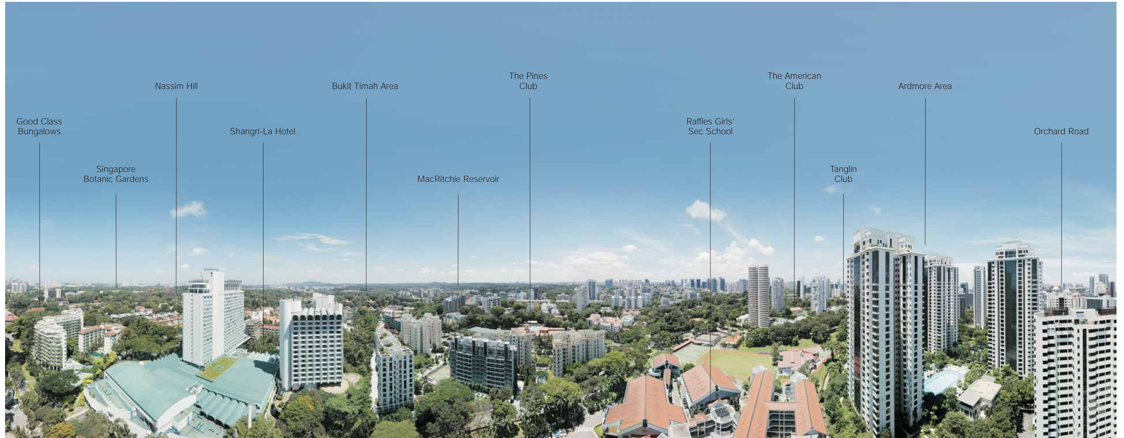
View from development site

Nouvel 18 is designed with considerations of the geography, history, colours, vegetation and landscapes. In the words of the master architect himself, “buildings are not done only to be the most beautiful, but also to give advantage to the surroundings. Each architecture is the missing piece of the puzzle, to create poetry with the place”.