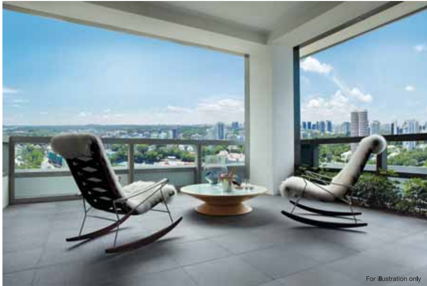
Private Balcony – The perfect place to revel in the evening tranquillity with the sparkling city skyline as your backdrop