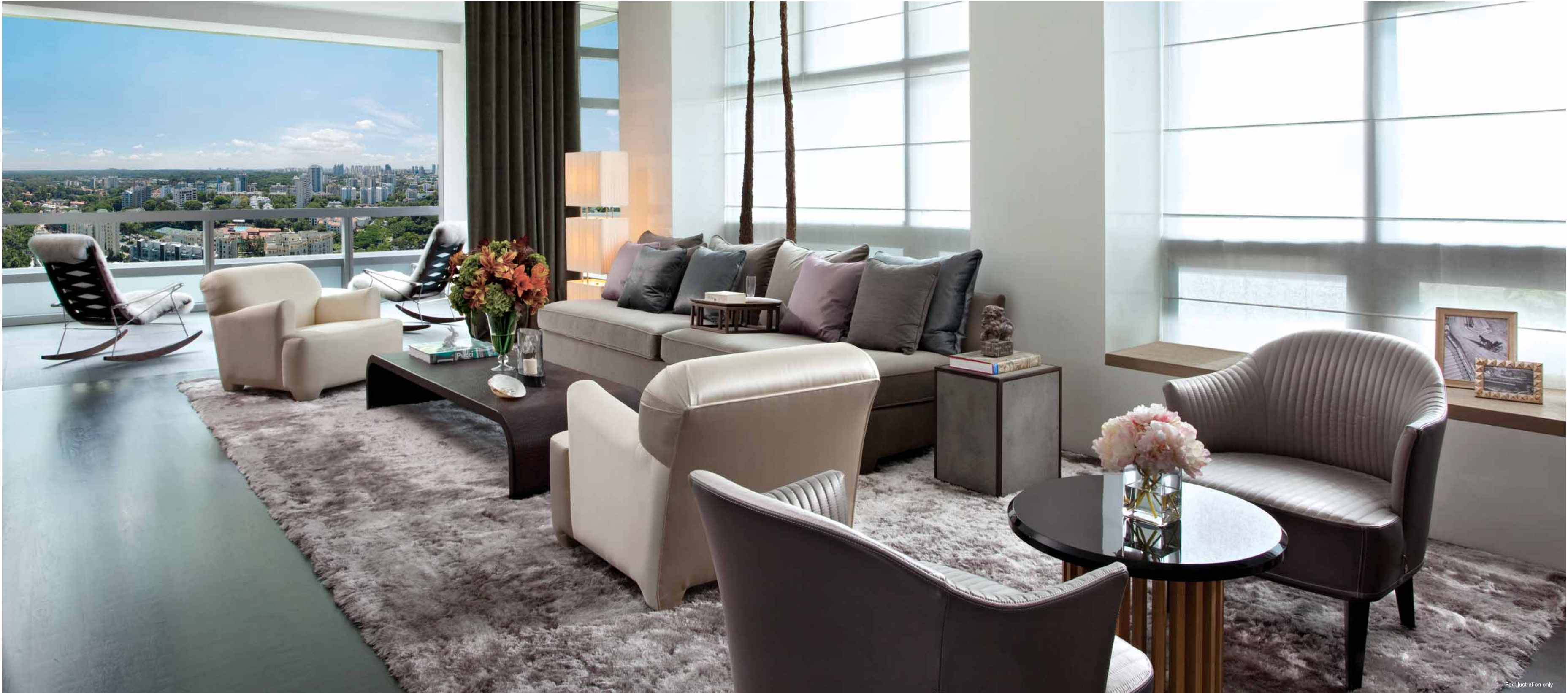
Living Room – Lavishly spacious and defined by meticulous design