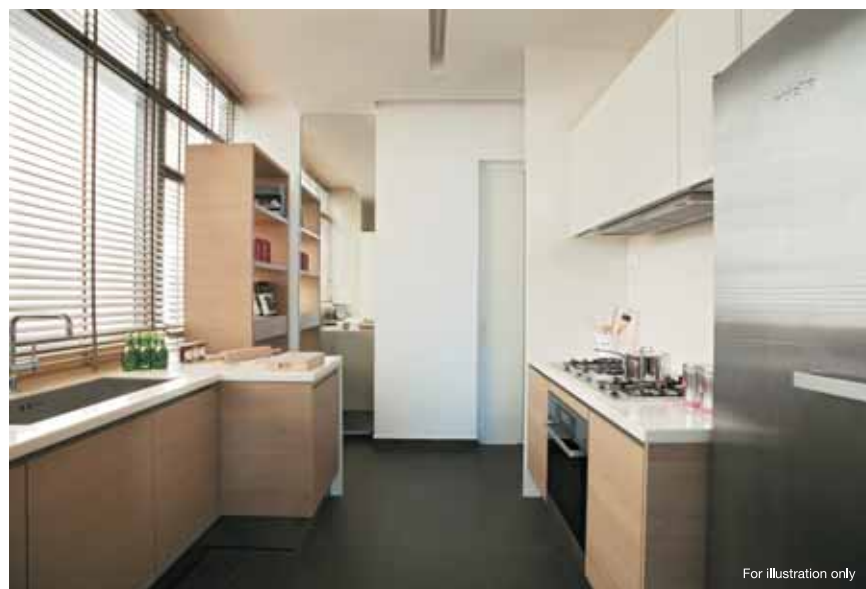
Kitchen – Fully equipped to impress with inspiring culinary creations